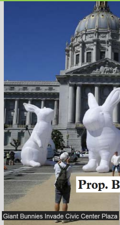
Giant Bunnies Invade Civic Center Plaza

Proposition B: San Francisco Park Fund Charter Amendment (June 2016)