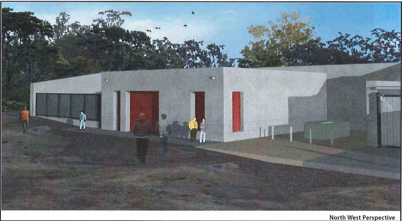
North West Perspective