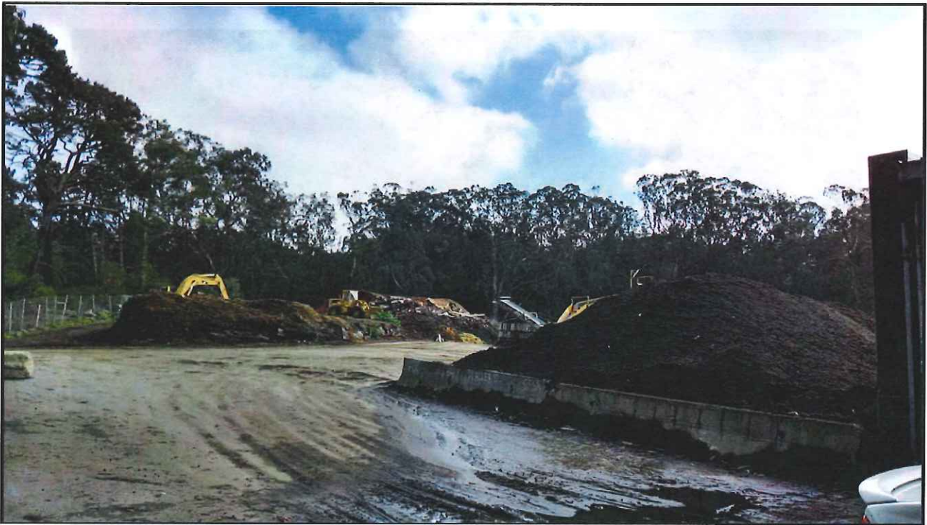
Existing Site Conditions