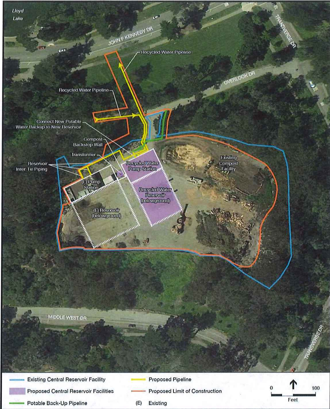
Exhibit D-1 Recycled Water Pump Station and Reservoir