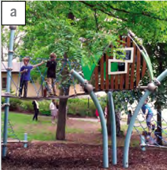
LOW- LITERAL PLAY