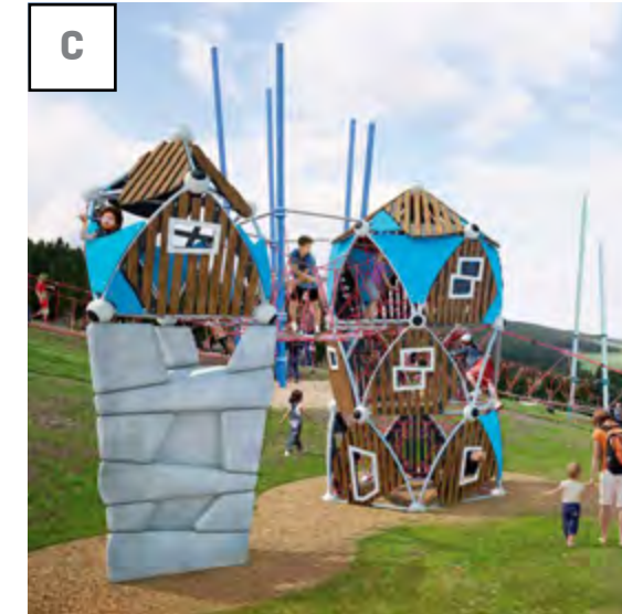
HIGH- LITERAL PLAY