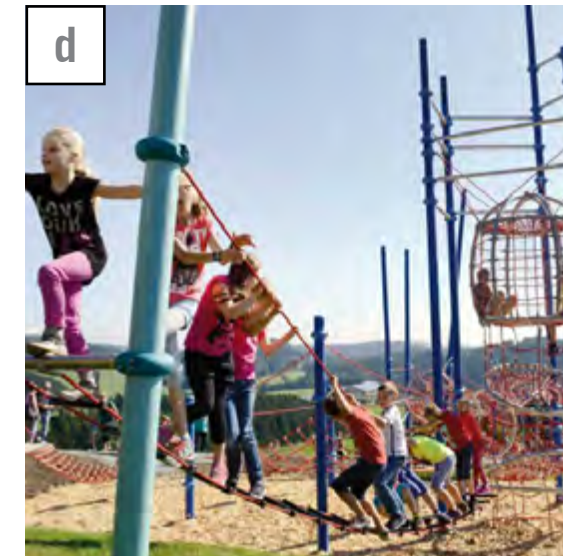
HIGH- ABSTRACT PLAY