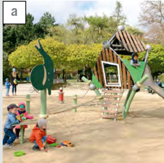
LOW- LITERAL PLAY