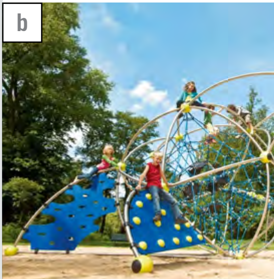
LOW- ABSTRACT PLAY