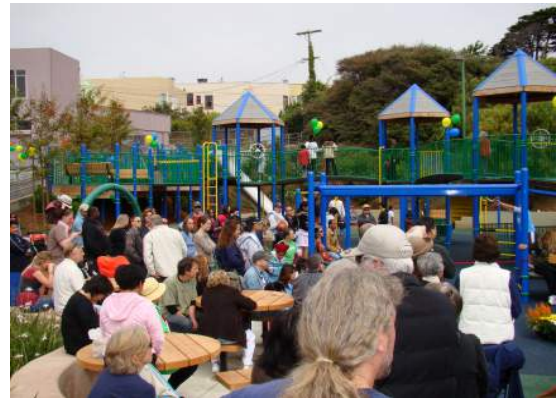
St. Mary's Playground reopened to the Public in July 25, 2009