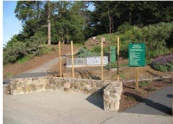
Buena Vista Landscape Improvement reopened to the Public in January 23, 2010.