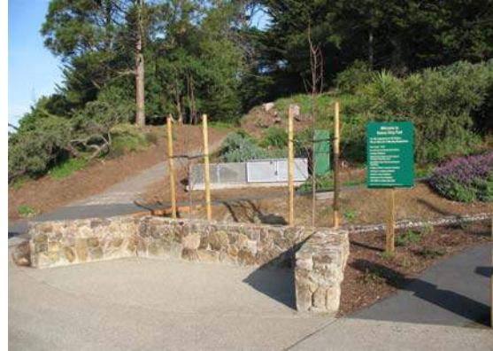
Buena Vista Landscape Improvement reopened to the Public in January 23, 2010.