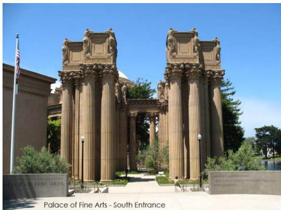
Palace of Fine Arts Restoration reopened to the Public in January 14, 2011.